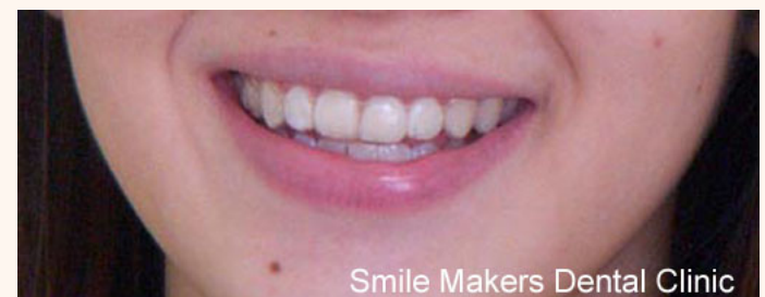
Can you tell that this lady is wearing Invisalign?

If you are concerned about image especially when meeting clients, or if the thought of having metal and wires fixed to your teeth seem too much to bear, find out if your condition is suitable for the Invisalign system that uses a series of clear, removable aligners to gently move the teeth – without anyone knowing. As the aligners can be removed for eating and cleaning, it does offer convenience and less discomfort than metal braces.