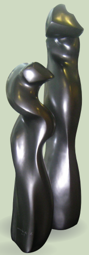
Mother & Child