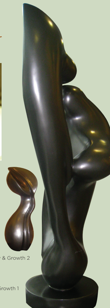
Joy & Growth 2