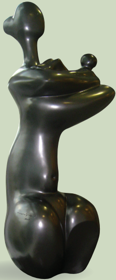
Close to My Heart