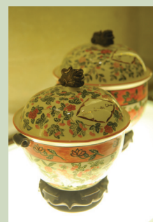
Ornamental jars carrying autographs of Minister Mentor Lee Kuan Yew and Mrs Lee